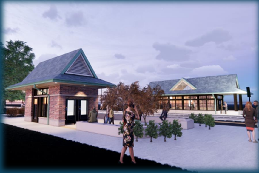
Rock Island 115th Station