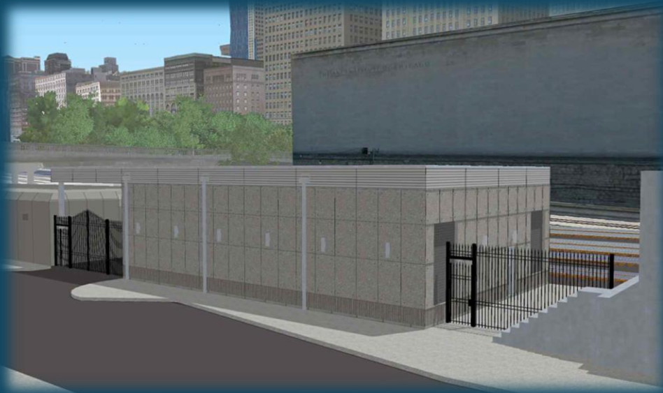
Jackson St. Substation