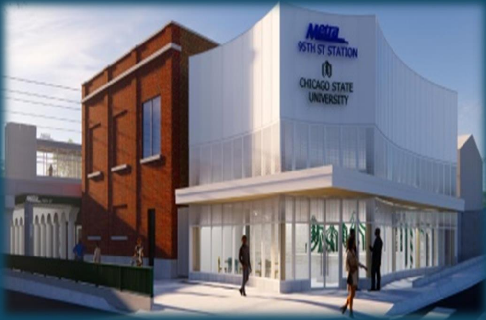
95 th Street Station