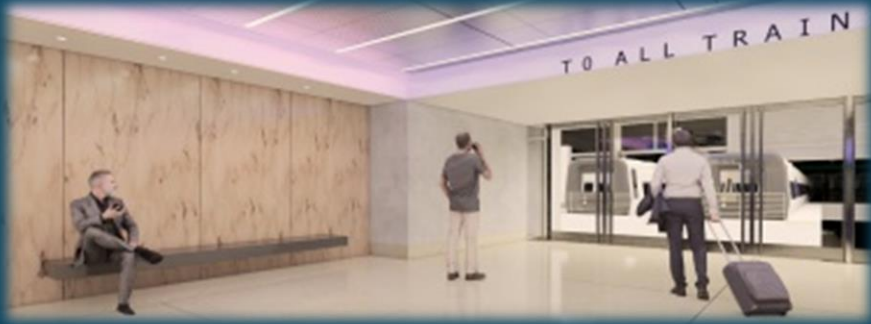
South Water St. Station