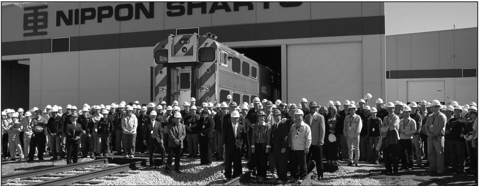
Metra, Sumitomo and Nippon Sharyo officials join workers at Nippon Sharyo's new plant in Rochelle, Ill., last month to mark the completion of the first two Metra Electric Highliner cars. The new cars could be carrying passengers as soon as November.